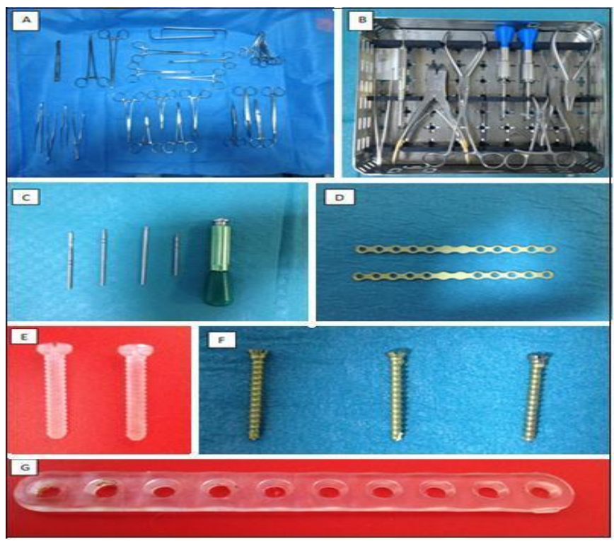
Figure 1. A: Surgical instruments used for routine operations, B: Mini titanium plate fixation tool set, C: Resorbable plate drill, diestock and screwdriver tool set, D: mini titanium plate, E: Resorbable screw, F: Mini titanium screw, G: Resorbable plate.

Selection of mini titanium plate and screw: 2mm mini titanium plate and screw set was used in the cases. 1 mm thick, 10 holes plates with 2 screw hole length space between 5<sup>th</sup> and 6<sup>th</sup> holes were specially manufactured (Trimed®, Trimed A.Ş, Turkey). A specially manufactured fixation set was used to implement plates and screws onto bones (Figure 1).